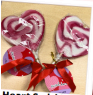
Heart Swirl Lolly £1.50