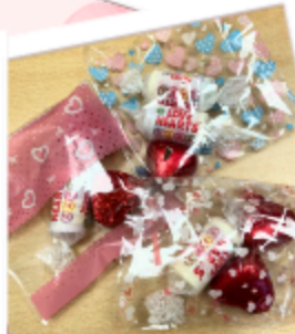
Sweet Gift Bag 50p

♥ Other items available are: Little tube of Love Hearts 10p