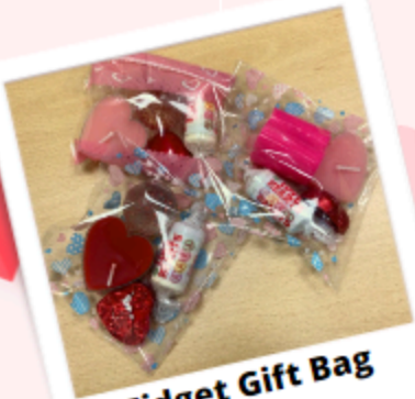
Fidget Gift Bag £1

Love is certainly in the air at The Quinta next week. The School Shop will be selling a selection of "lovely" items in the IT Suite each lunchtime. Please see the prices opposite in case your child would like to purchase any sweet treats.