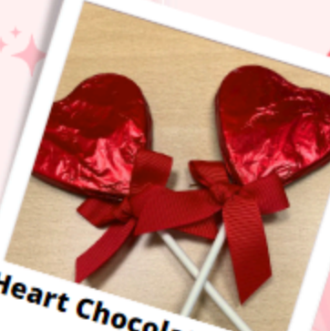
Heart Chocolate Lolly £1.50