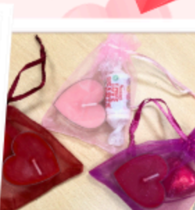
Tealight Gift Bag 60p