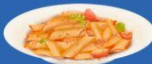
Hot pasta with tomato and mascarpone sauce