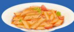
Hot pasta with tomato and mascarpone sauce