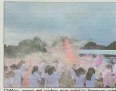
Children, parents and teachers were coated in fluorescent paint powder.