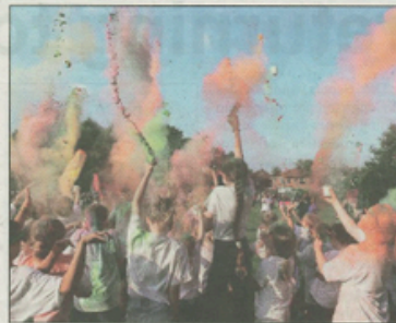
The event was the school's "best yet".