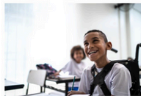
Oakenclough Family Hub Colshaw Drive, Wilmslow SK9 2PZ

For all parents/carers with children aged 0-25 who would like to find out more about our SEND Local Offer and how we can support you and your child. Drop in and meet with multiple agencies all in one place!