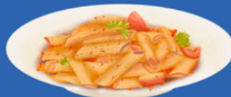
Hot pasta with tomato and mascarpone sauce