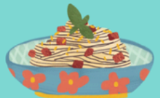
Build your own pasta