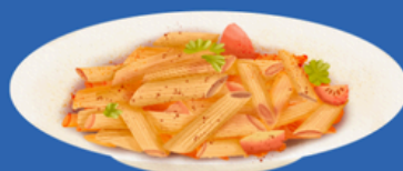
Hot pasta with tomato and mascarpone sauce